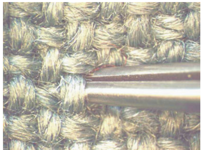
FIG. 3—Detail of the seeding of a target fiber in the weave of the chair seat.

into the weave in a regular pattern using five rows of four fibers and working left to right.