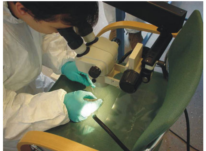
FIG. 2—Seeding of a chair in preparation of the recovery experiment.

Each fiber was seeded by the same person in the same way: all fibers were put under a warp thread making sure the fibers protruded no less than 2 mm and no more than 5 mm using tweezers and a stereomicroscope (Figs. 2 and 3). The 20 fibers were placed